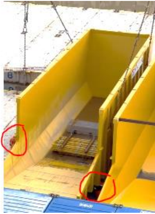
Two stevedores were recently observed crawling below a suspended container.

All cargo types can fall during a lift. Examples below of dropped steel coil, wood pulp, aluminium ingots, and a mining truck.