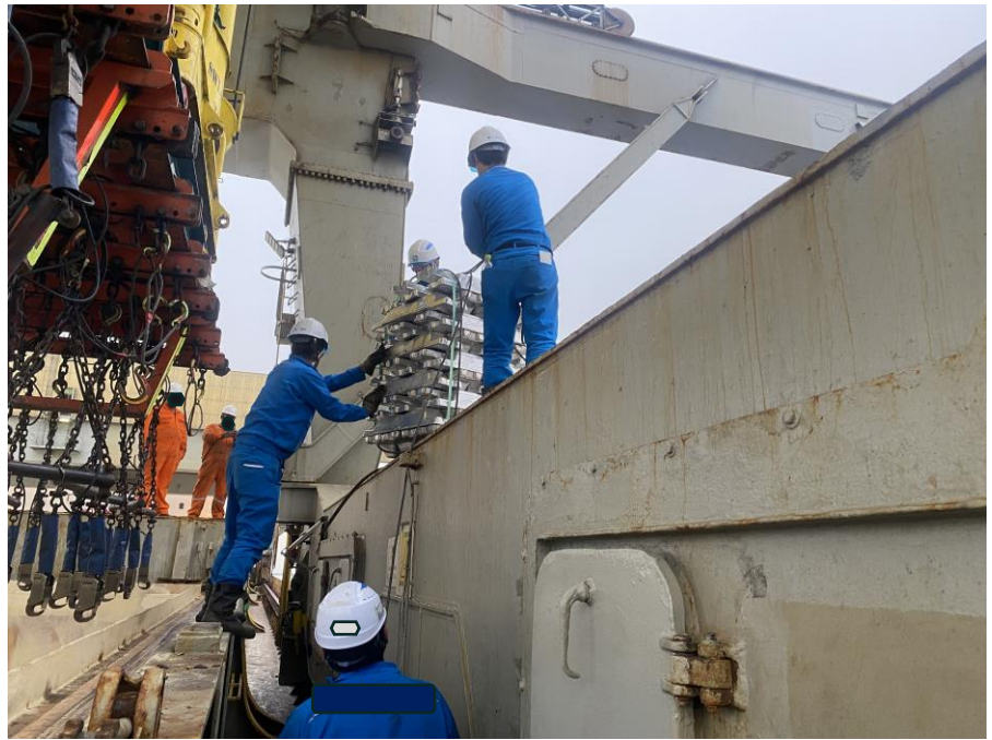
While recovering the ingots from the crane beam the vessel's Life-saving Rule about falling was apparently forgotten.